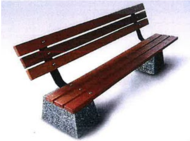
Park Bench – Standard (CAPILANO) not recommended