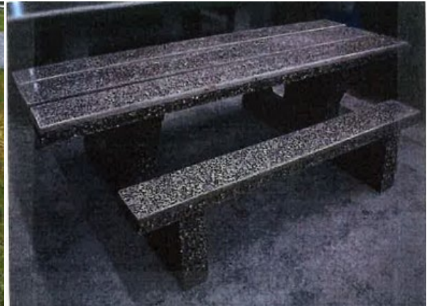
Picnic Table – Optional (6 ft long w/1ft overhang)