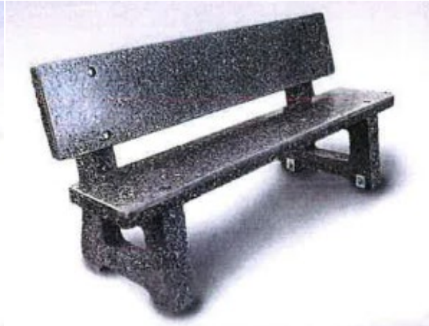
Park Bench – Optional (Garibaldi)