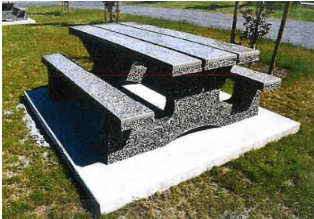
Picnic Table – Standard (6ft long, concrete)